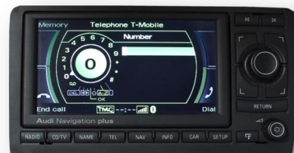
Audi Navi PlusRNS-E

The interface enables the telephone bus of the factory navigation system. Therefore in principal, the operation is analogue as described in the manual of the navigation/radio system.