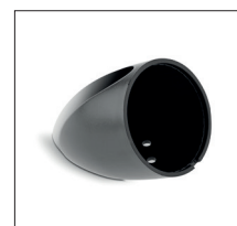
Tilted mounting frame: Easy to install