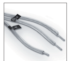
Mounting options: car and display