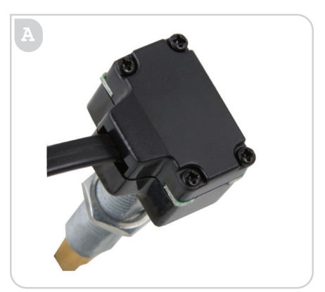
Step #1 Installing the extension cable into the radio shafts

Remove the plastic shaft cover by removing the four small black screws at the back of the shaft (do not lose the screws).